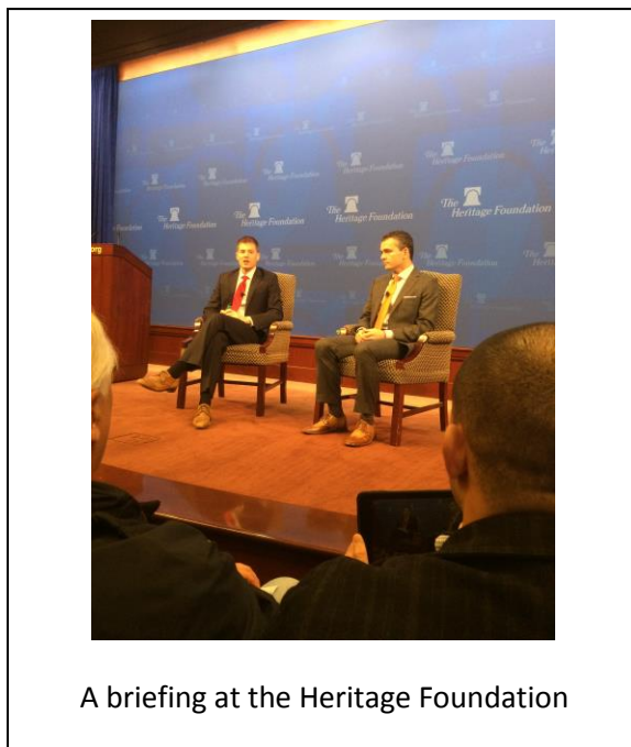
A briefing at the Heritage Foundation

This type of freedom comes in many forms Despite the many fronts under attack The conscientious will rebuke these storms And Jack please know that many have your back!!!