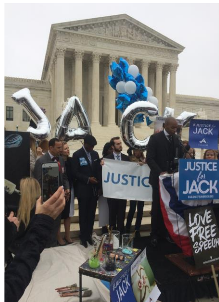
One of many speeches made by women and men of all races, religions and backgrounds