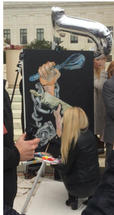
The speed painter who works much faster than this author does...